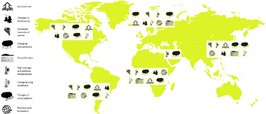
Figure 2. ICAO 2019 International Climate Change Risk Map.

Thirty percent of corresponding nations already had implemented some climate change adaptation measures, another 25% were planning to do so within ten years, and only 6% of states had no such plans. There is a general accord amongst respondents and expert authors that present adaptations are inadequate. Based upon responses, ICAO created a risk map, reproduced in Fig. 2.