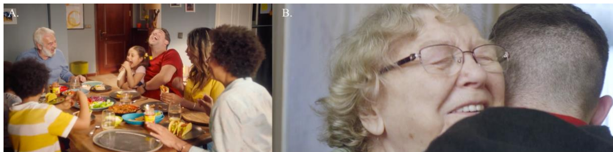
Figure 2: Examples of the Perfect Grandparent

The Perfect Grandparent is never alone—but surrounded by family, often made up of several generations. Narratives involving this type are always positive, showing happy and smiling individuals who are in good health, laughing and enjoying the company of others. Frequently, a Perfect Grandparent will be showing affection towards members of their family. Their advanced age is revealed not only by their role within the social setting, but also by their visual appearance, with age markers such as gray or white hair being apparent. However, stereotypical signs of frailty or old age illnesses are not present. The Perfect Grandparent appears in a variety of settings, for example, engaging in physical activities with their grandchildren, such as riding a bike, or simply sitting around a dinner table with their entire family. This type is evenly distributed between females and males, and ranges in age from adults in their 50s to those in their 70s. The Perfect Grandparent advertises a variety of product and services, but primarily food, beverages, and tourism.