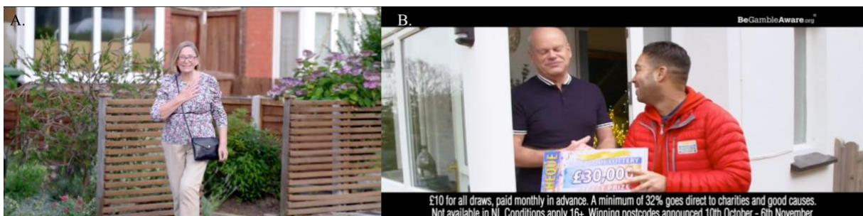
Figure 8: Examples of the Jane or Joe Public

The Jane or Joe Public is distinct from other types as they are not part of a comedic narrative, or show health impairments. Their family ties and romantic relationship with others are also not further explored. They are simply a depiction of a slice of life as part of the narrative.