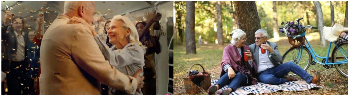
Figure 7: Examples of the Happy Couple

What differentiates this type from Golden Agers is the narrative’s focus on their affectionate relationship and interaction between each other, which overrides everything else. They also display more prominent visual age markers. The Happy Couple is not the Perfect Grandparent, due to a lack of immediate family interaction—that is, their attention is on each other rather than on their (grand)children. Also, unlike the Perfect Grandparent, the Happy Couple always appears together.