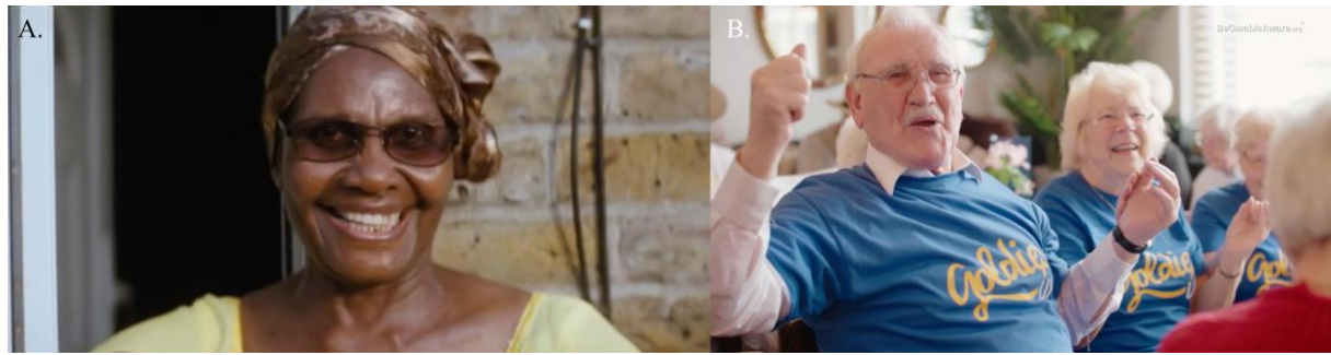
Figure 5: Examples of the Coper