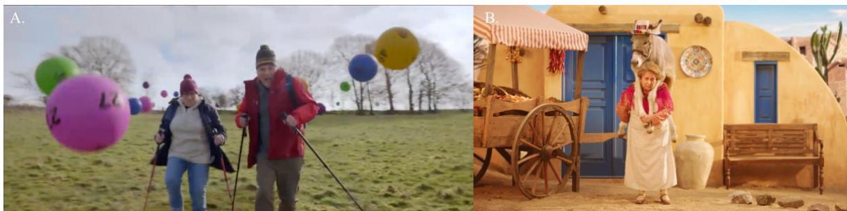
Figure 4: Examples of the Comedic type

Older characters of the Comedic type are to be found in humorous situations, and although we occasionally laugh with them, generally, the narratives are crafted in a way that makes us laugh at them. These humorous situations depicted are often ridiculous or absurd and unnatural or far-fetched, such as an older couple running down a hill to escape giant lottery balls hurtling toward them. We know of their advanced age due to physical identifiers; however, we do not laugh at them because of their age, but only due to the situations they find themselves in. It is usual to see Comedic types in outdoor settings, occasionally surrounded by others. Only very rarely are they the sole focus of a narrative. This type occurs as both female and male characters, with a female skew in the sample, and promotes mainly gambling services, as well as food and beverages.