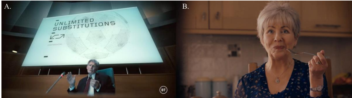
Figure 3: Examples of Mentor or Legacy

Source: BT TV commercial, 2020, and Princes commercial, 2020