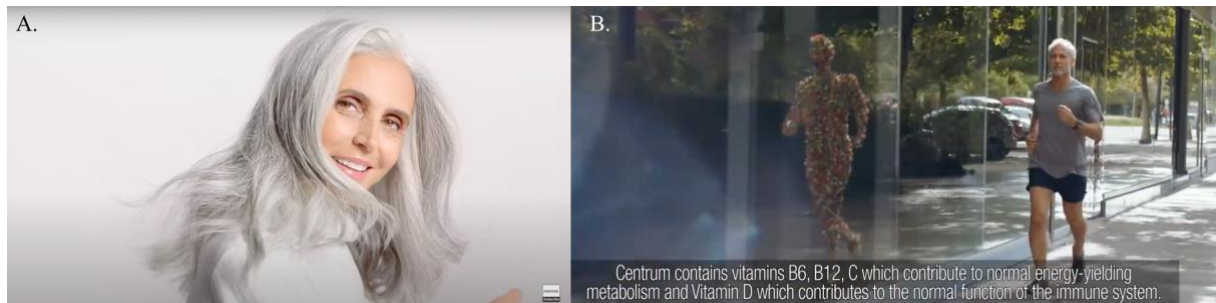
Figure 1: Examples of the Golden Ager

to their behavior; though on closer examination, the wrinkles on their faces or their graying hair becomes apparent. Nonetheless, they are always happy, smiling and clearly enjoying their advanced years. Whilst characters of this type are shown as independent, they may be in the company of an array of individuals from several different age groups. Golden Agers occur as both female and male characters, with a female skew in the sample, and are always under the age of 75 years. They frequently promote food and beverages, financial services and cosmetic products.