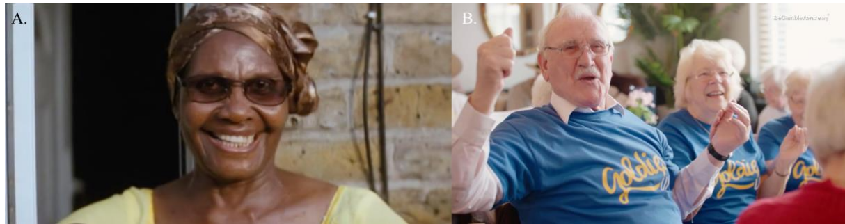
Figure 5: Examples of the Coper

sample, and characters are more often than not female. Copers advertise a broad range of services, and products from the food and beverage industry.