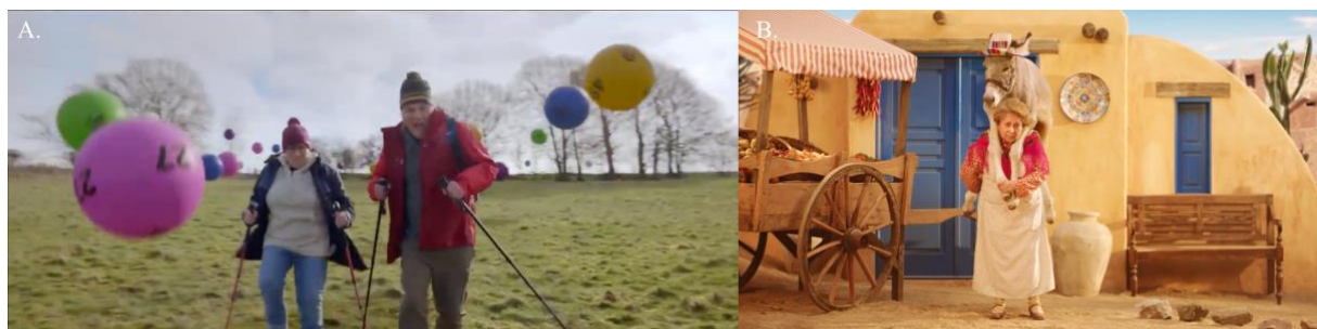
Figure 4: Examples of the Comedic type

Older characters of the Comedic type are to be found in humorous situations, and although we occasionally laugh with them, generally, the narratives are crafted in a way that makes us laugh at them. These humorous situations depicted are often ridiculous or absurd and unnatural or far-fetched, such as an older couple running down a hill to escape giant lottery balls hurtling toward them. We know of their advanced age due to physical identifiers; however, we do not laugh at them because of their age, but only due to the situations they find themselves in. It is usual to see Comedic types in outdoor settings, occasionally surrounded by others. Only very rarely are they the sole focus of a narrative. This type occurs as both female and male characters, with a female skew in the sample, and promotes mainly gambling services, as well as food and beverages.