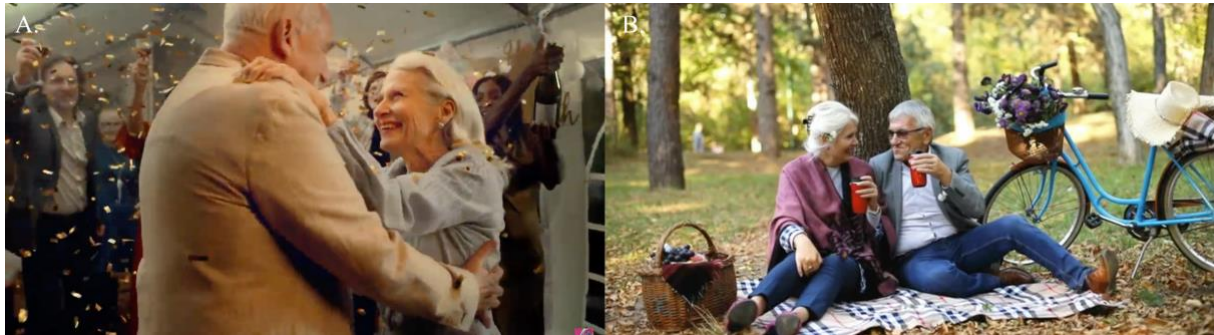
Figure 7: Examples of the Happy Couple

What differentiates this type from Golden Agers is the narrative's focus on their affectionate relationship and interaction between each other, which overrides everything else. They also display more prominent visual age markers. The Happy Couple is not the Perfect Grandparent, due to a lack of immediate family interaction—that is, their attention is on each other rather than on their (grand)children. Also, unlike the Perfect Grandparent, the Happy Couple always appears together.