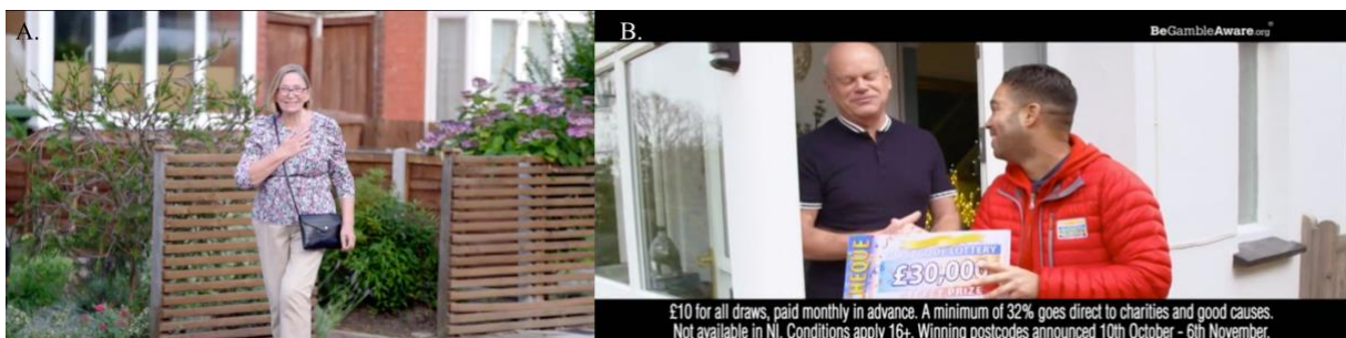
Figure 8: Examples of the Jane or Joe Public

The Jane or Joe Public is distinct from other types as they are not part of a comedic narrative, or show health impairments. Their family ties and romantic relationship with others are also not further explored. They are simply a depiction of a slice of life as part of the narrative.