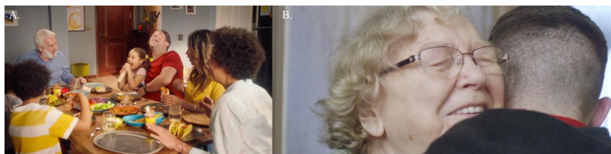
Figure 2: Examples of the Perfect Grandparent

The Perfect Grandparent is never alone—but surrounded by family, often made up of several generations. Narratives involving this type are always positive, showing happy and smiling individuals who are in good health, laughing and enjoying the company of others. Frequently, a Perfect Grandparent will be showing affection towards members of their family. Their advanced age is revealed not only by their role within the social setting, but also by their visual appearance, with age markers such as gray or white hair being apparent. However, stereotypical signs of frailty or old age illnesses are not present. The Perfect Grandparent appears in a variety of settings, for example, engaging in physical activities with their grandchildren, such as riding a bike, or simply sitting around a dinner table with their entire family. This type is evenly distributed between females and males, and ranges in age from adults in their 50s to those in their 70s. The Perfect Grandparent advertises a variety of product and services, but primarily food, beverages, and tourism.