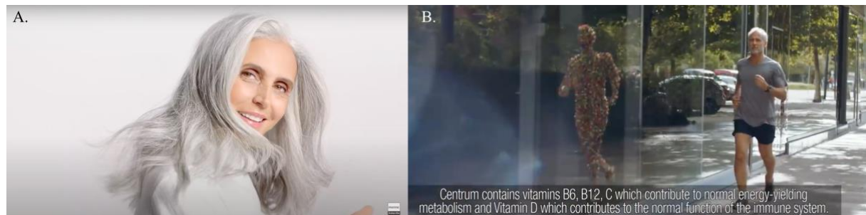
Figure 1: Examples of the Golden Ager

The Golden Agers are young at heart and often presented as health-conscious and physically active. Characters of this type can be described as beautiful, even glamorous, and it is shown through the narrative of the advertising that they take pride in their appearance. As such, they are individuals who appear well-dressed, sophisticated and youthful, for example. At first glance, the Golden Agers might not appear to be of an older age, among others, due to their behavior; though on closer examination, the wrinkles on their faces or their graying hair becomes apparent. Nonetheless, they are always happy, smiling and clearly enjoying their advanced years. Whilst characters of this type are shown as independent, they may be in the company of an array of individuals from several different age groups. Golden Agers occur as both female and male characters, with a female skew in the sample, and are always under the age of 75 years. They frequently promote food and beverages, financial services and cosmetic products.