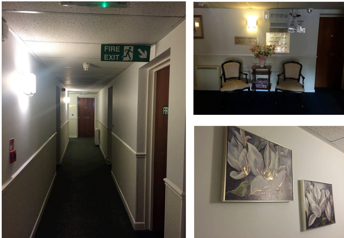
Figure .2: Left is a snapshot of one of the corridors walked along within the development. Upper right is the lobby at the start of the route that participants took. Bottom right is some of the artwork shown along the corridor walls.

Figure 1: This image depicts the route participants took through the development. The yellow star indicates the start of the route, and the orange star shows where the route finished.