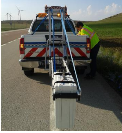
Fig. 2. The GPR equipment.