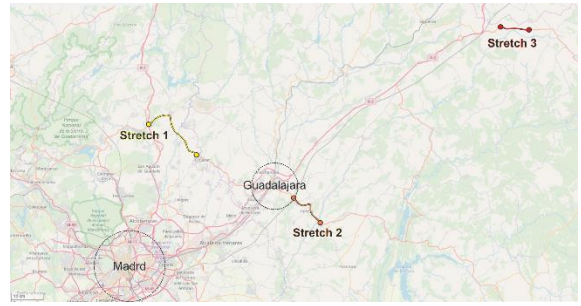
Fig. 1. The surveyed road network in the vicinity area of Madrid and Guadalajara, Spain.

The investigated road infrastructures are two-lane rural all-purpose highways with a flexible pavement structure.