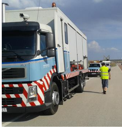
Fig. 3. The Curviometer non-destructive equipment.