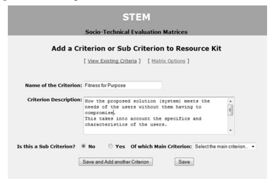
Figure 2: STEM - Defining criteria and sub criteria

These criteria, around which the discussion takes place, must be pre-defined by stakeholders. STEM therefore becomes more relevant as it allows partners to comment on the criteria according to their cultural sensitivity. Criteria are often defined and agreed upon during face to face meetings, telephone calls or emails. The administrator then adds these criteria into STEM and registers all participants to initiate the evaluation process.