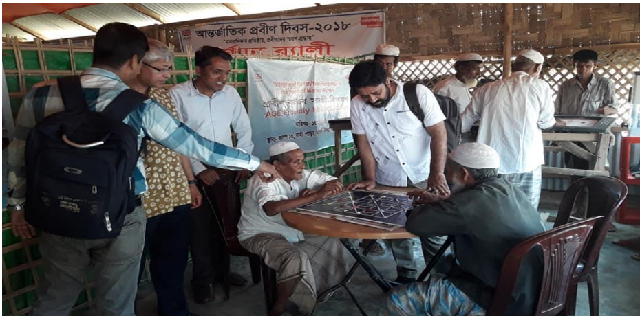
Recreation facility for Elderly People