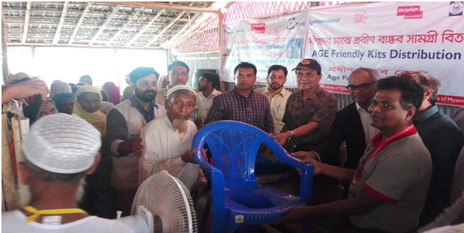
Ex. Cabinet Secretary Distribute Age Friendly Kits to Disable OP