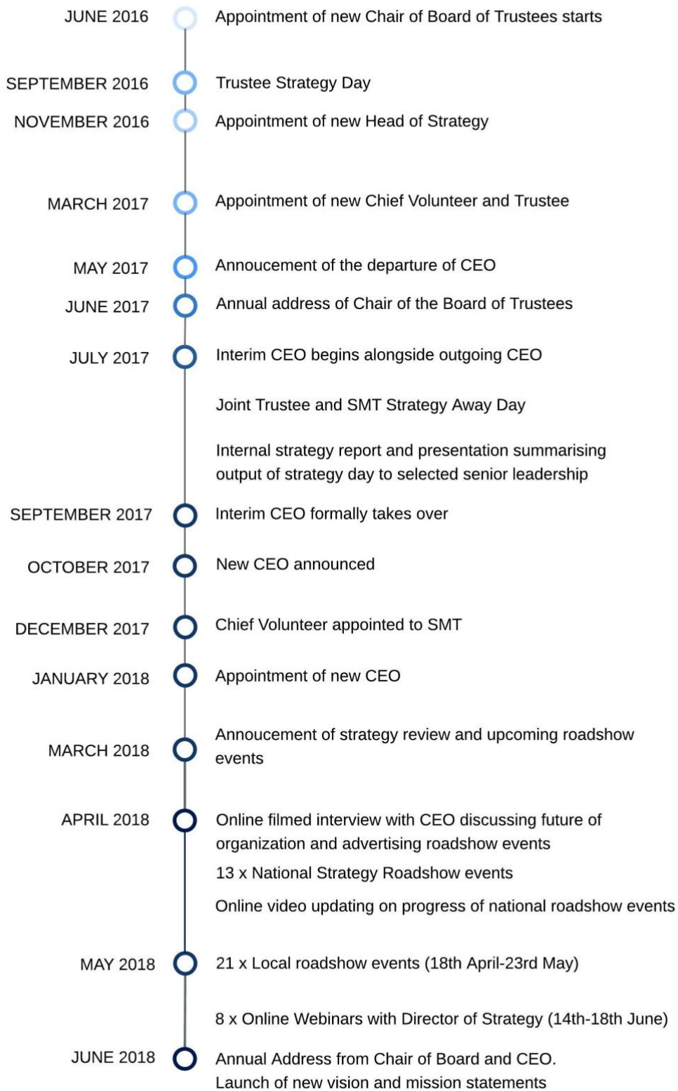
Figure 1: Strategy formulation timeline