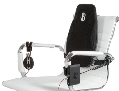
Figure 4. The Subpac S2 Headphone Subwoofer. (image from [18])

As well as the motion of the pod, a haptic feedback device – Subpac – added additional vibration at the back seat. It was observed that toggling vibration on/off added more impact than uninterrupted operation at different intensity levels (the haptic experience being continuous due to the movement of the pod), so a separate audio track was created just to trigger the Subpac at certain points.