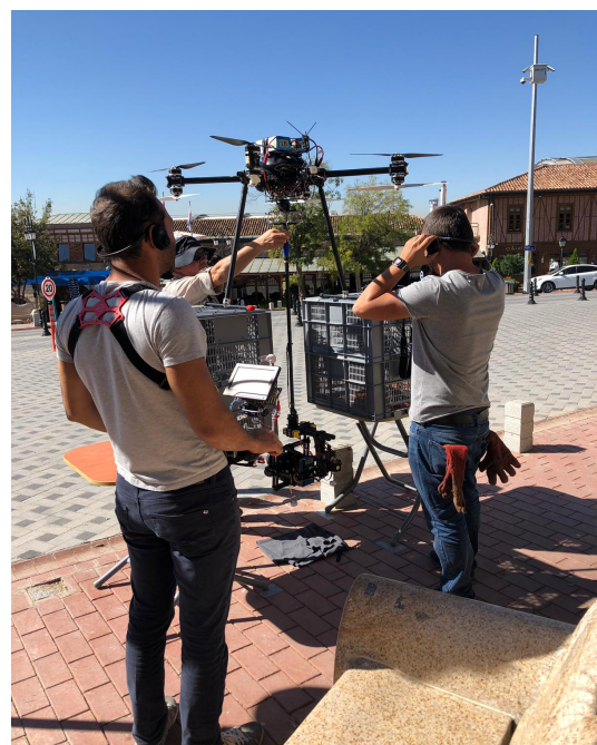
Figure 3. Preparing the drone.

Telemetry data was captured from the drone flights to recreate the movement of the on-board Red Digital Cinema camera (which had a 260-degree lens). These movements were both refined and augmented in post-production. The data was then implemented in the Unity game engine, and this provided a control signal to make the pod tilt accordingly.