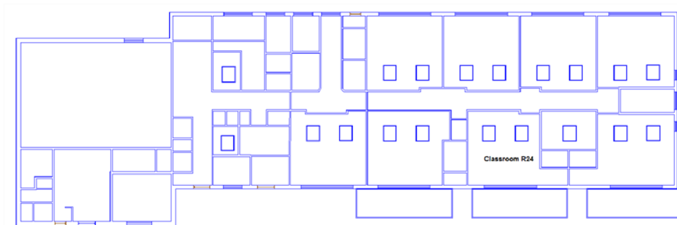
Fig. 2 2D model of the building created in EDSL TAS