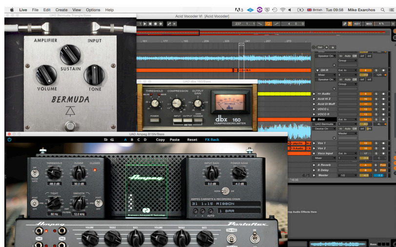
Figure 4. software plug-ins utilised on a Spector Euro 4lx doug wimbish electric bass GUITAR Di RECORDING.

□ Instrumental mix: https://soundcloud.com/user-562957398/freak-for-you-instrumental/s-Kt6Q1