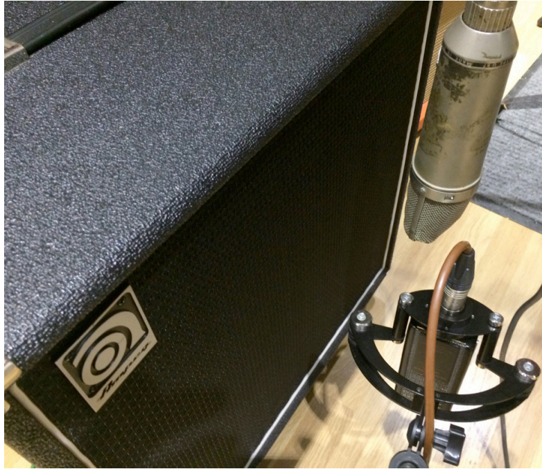
Figure 3. Neumann U 67 and sontronics sigma ribbon microphones positioned in front of an ampeg ba-115 bass amplifier with A single celestion speaker.

Orpheus Prism converters. Using Pro Tools HD, the Fender Precision electric bass part was recorded using a DI, a Neumann U 67 microphone (approximately six inches away and off-axis from the speaker), and a Sontronics Sigma ribbon microphone (around twelve inches away from the speaker and perpendicular to the U 67); the bass was amplified using an Ampeg BA-115 featuring a single fifteen-inch Celestion driver (see Figure 3 below). The mono ribbon source was recorded onto two tracks, which were panned hard left and right with the left channel phase-reversed.