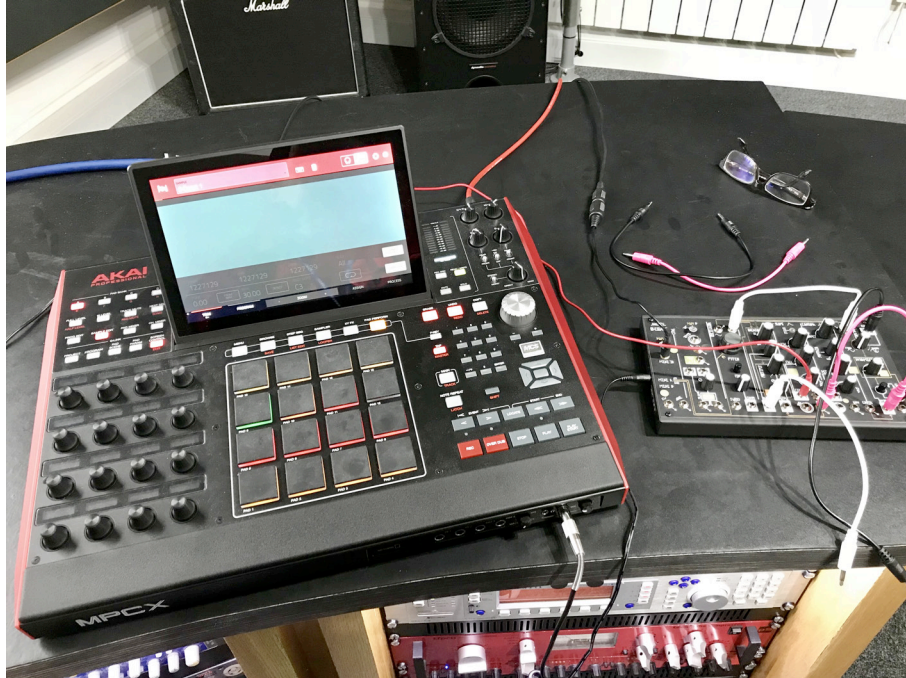
Figure 5. An akai mpc x sampler/drum machine and make noise 0-coast semi-modular synthesiser used for sampling, drum-programming and synthesis for the hip-hop/electronica case study.

Furthermore, the distorted electric bass was spread in stereo using an onboard flanger insert effect on the MPC, before being sent—rather heavily-handedly—to a short stereo auxiliary reverb. Excessive low/sub frequencies were avoided by virtue of the distortion and flanger effects, allowing sufficient space in the frequency spectrum for the electronic elements to come (this could be secured further with high-pass filtering, which in this case was not deemed necessary). The aim here was to both widen the electric bass but also stage it further ‘away’ on the depth axis as a sampled element that would provide ‘space’ (both panoramic and ambient) for the added, synthetic basses.