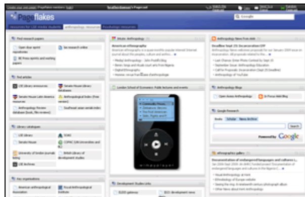
Figure 4: Screenshot of a Start page

content to your start page. There are a wide variety of widgets, typical examples include audio players, calendars, bookmarks and integrations with web2.0 services such as Flickr & YouTube, as well as games and more light-hearted applications.