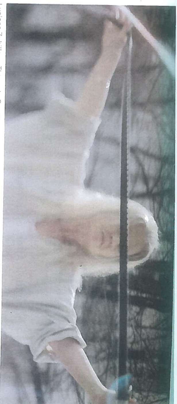
Luciano Zubillaga Things to Come

Things to Come is part of Alien Cartographies , a series of three films by Luciano Zubillaga that explore how 'posthumanism' and 'decolonial options' may come to effect how we see and experience narratives of spacetime within moving image and art practice.