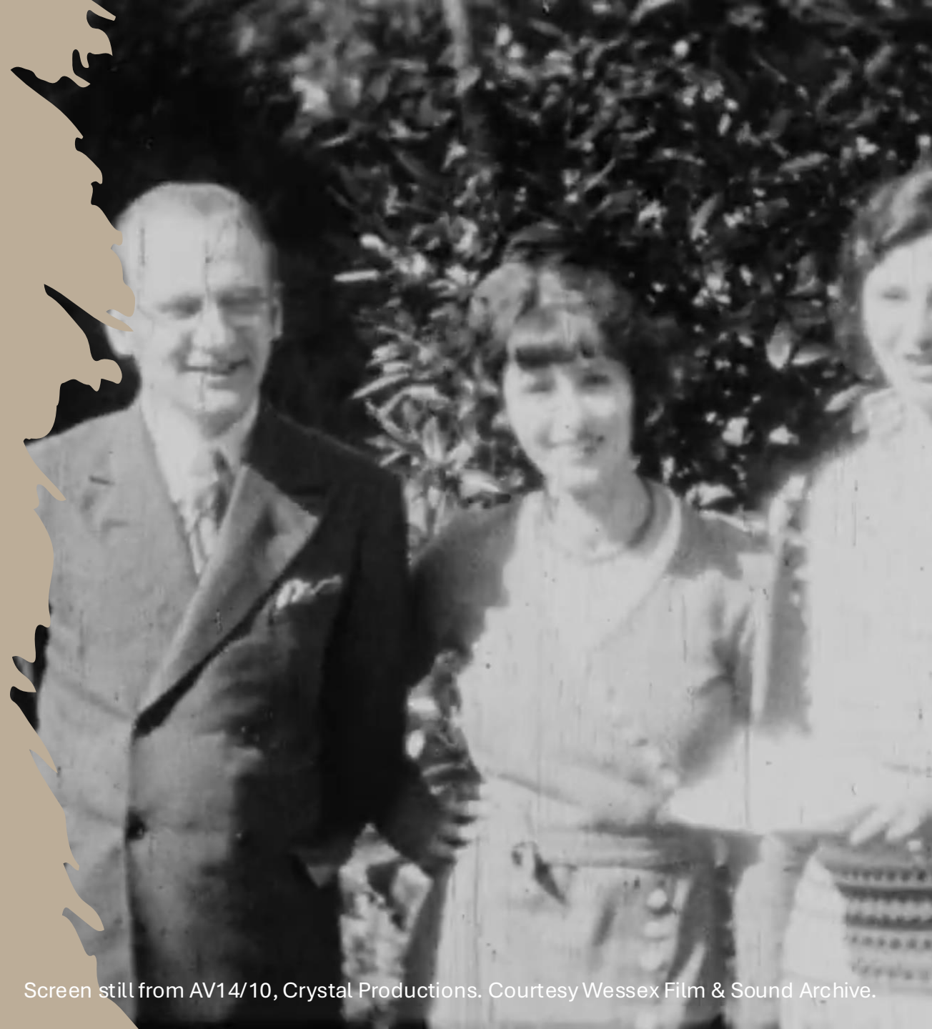
Screen still from AV14/10, Crystal Productions.