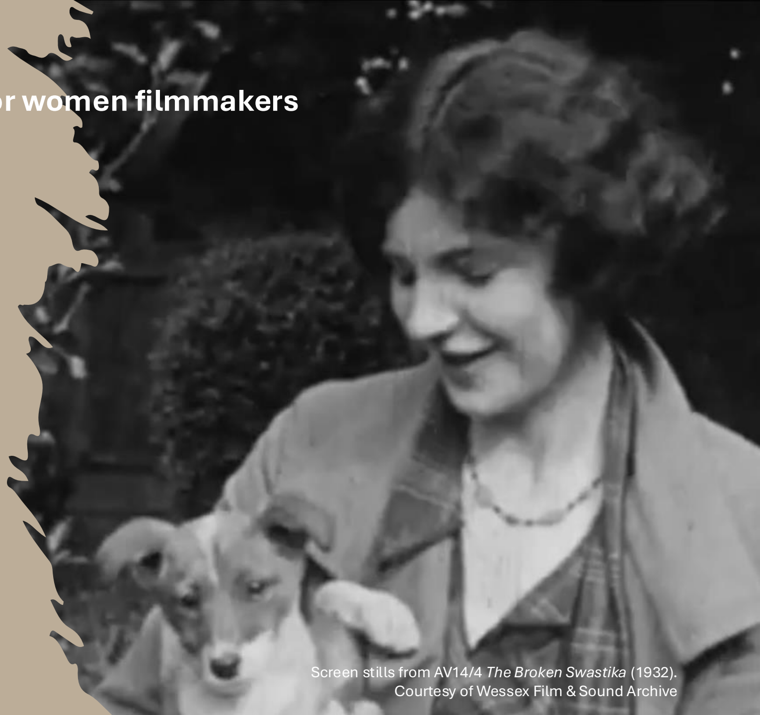
Screen stills from AV14/4 The Broken Swastika (1932).