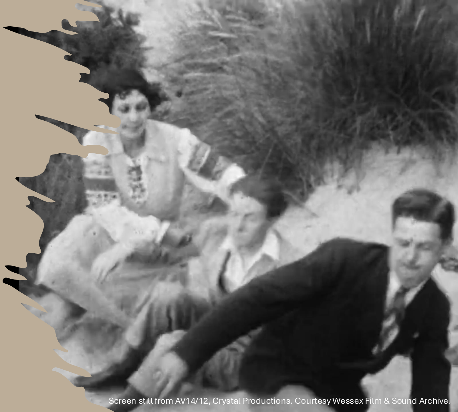
Screen still from AV14/12, Crystal Productions.