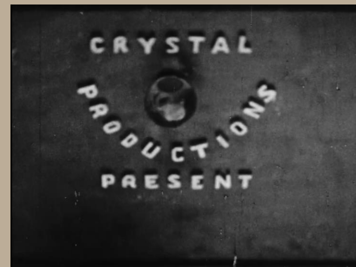
Screen stills from Where Bournemouth Dances (AV14/6), 1930