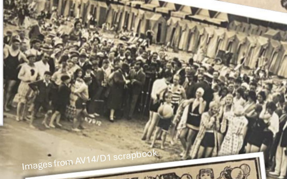
Images from AV14/D1 scrapbook