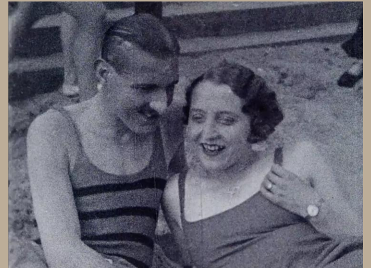
Screen stills from The Broken Swastika (AV14/4), 1932