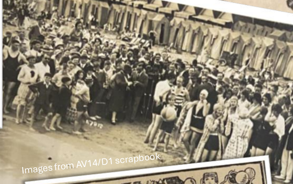
Images from AV14/D1 scrapbook