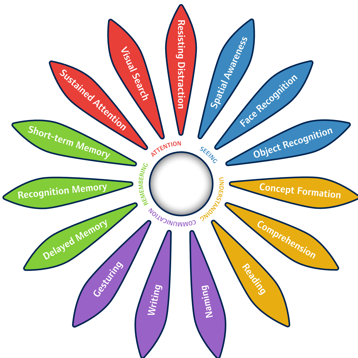
Fig. 1 The Cognitive Daisy

introduction of COG-D increased staff ratings of their own understanding of residents’ cognitive problems, and that staff perceived the Cognitive Daisies as highly useful for delivery of person-centred care [20].