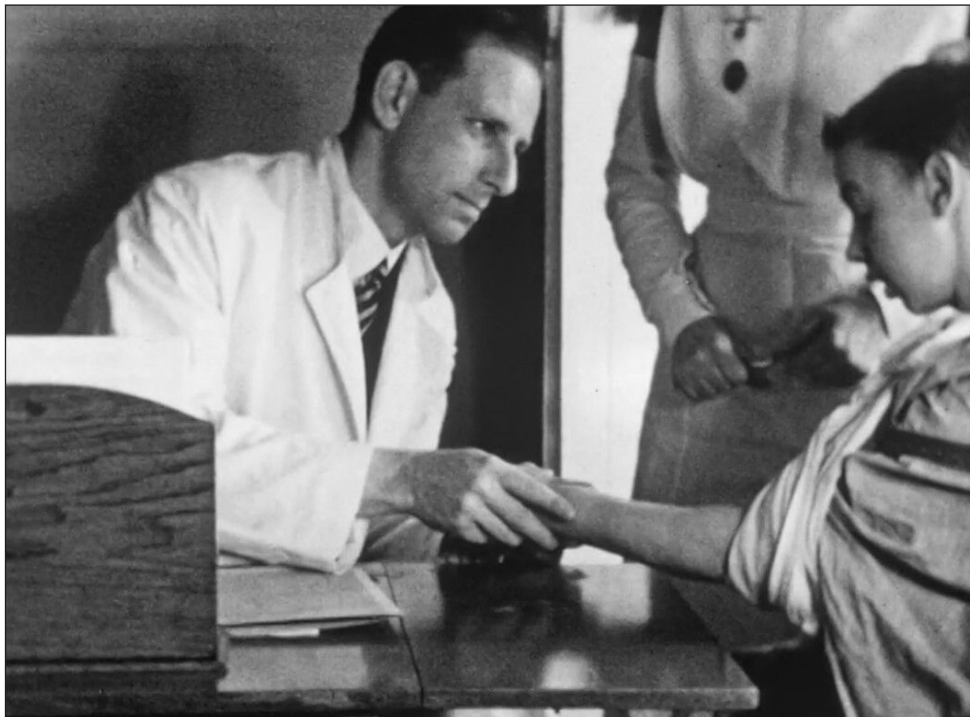
Figure 2: 'Case examined by a visiting surgeon or the first assistant', The Functional Treatment of Fractures Part 1 (1937) [video still], Produced by T.J. Smith and Nephew Ltd. Public Domain.