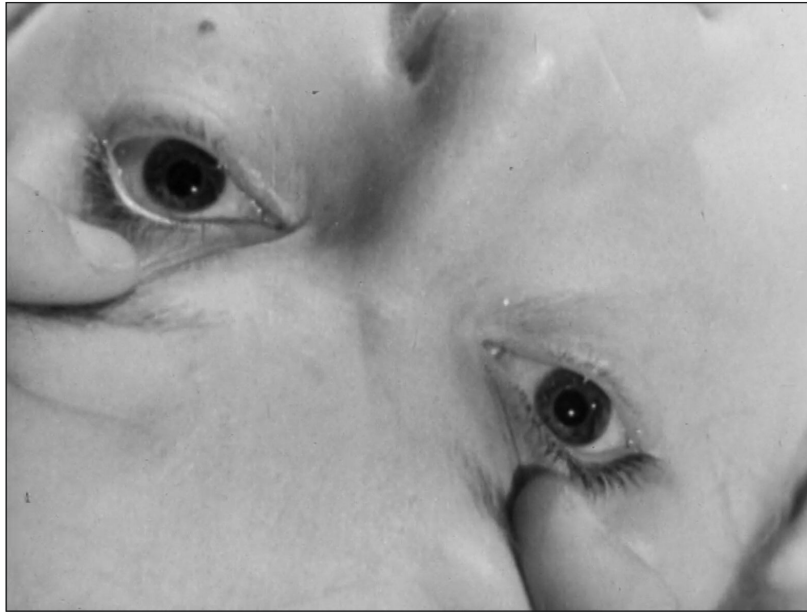
Figure 4: 'Eye movement under anaesthesia', Open drop ether (part one). No. 2. (1944), [video still], Direction by Margaret Thomson, Photography by A.E. Jeakins. Produced by Realist Film Unit. Made with the co-operation of the Department of Anaesthetics, Westminster Hospital, London. UK: Public Domain. Image courtesy of Wellcome Collection.