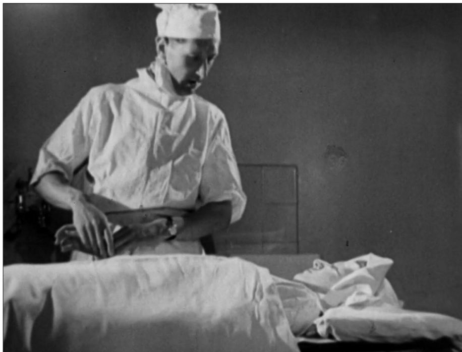
Figure 3: ‘Feel her pulse, try to reassure her’ [commentary], Open drop ether (part one) . No. 2. (1944) [video still], Direction by Margaret Thomson, Photography by A.E. Jeakins. Produced by Realist Film Unit. Made with the co-operation of the Department of Anaesthetics, Westminster Hospital, London. UK: Public Domain. Image courtesy of Wellcome Collection.

relating to the content and delivery with the first film being ‘too long and contains rather too much diagram work’. This refers to detailed descriptions of the planes of anaesthesia using Guedel’s chart, which is laboriously annotated with animations to illustrate the presentation of every reflex in anaesthesia using the inhalation method. The reviewer’s comment suggests that a balance needs to be made between text and image, with, on this occasion, some fatigue creeping in regarding the chosen form of delivery. The second film, Open Drop Ether (1944), was considered the best film in the series due to its wider utility and the way that the technique of induction is shown ‘with great care.’ In fact, both film titles were written and directed by the same person, Margaret Thomson (1910–2005). As well as outlining the requisite apparatus, there is an emphasis on pre-operative care and making sure that the patient is comfortable and thus less anxious when they are induced. The doctor, 8 in a surgical gown and hat, is exhorted to have a ‘few kindly words’ with the patient and take her pulse for reassurance (see Figure 3 ). Another feature of the film is that there is footage of the patient