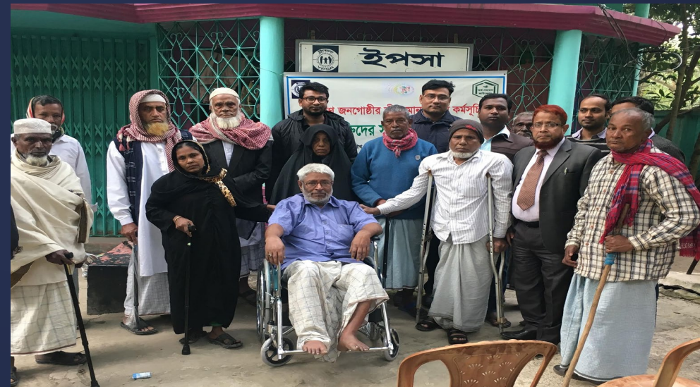
Deliverable aids to the elderly