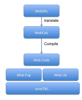
Figure 4. Proposed Architecture

To help implement this DSL for use on multiple platforms, an architecture for making applications platform-independent needed to be defined shown in fig 4. In the proposed architecture, essentially there are 3 tiers: (1) the application, written and compiled using the DSL; (2) the DSL specific engine, and implemented libraries; (3) the running platform, be that Java, C#.NET, Android or iOS (iPhone). For each of the target platforms, the virtual machine will comprise of two major parts. Firstly there will the platform libraries (MobLib) which will contain the specific platform api calls. This library will contain the callable display, interface, and underlining methods of that platform. Secondly the engine, that will run the compiled code and make the appriopriate platform calls using the the bundled platform library set.