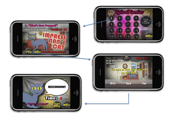
Figure 2. LG Screen Transitions

2) Lyrical Genius: This application was created as a game that consist of quiz questions relating to different lyrics in songs. This game though still using the Apple Cocoa Framework is quite different in many ways. Firstly this application does not use XML files as persistance of data, but uses a SQLite database for storing level and question data. Other features of this game include music that is played in the background that can be switched on/off and sound effects for if the user chooses the correct or incorrect answer. These features require threading, which is one issue we must consider in the DSL. The game also includes a timer, for which the user must get a number of correct answers within a time limit. This makes use of threading again, and also another important area as the use of timing can be needed in many different contexts. Finally, though the use of Cocoa was made, with the use of button images and background images the application was made to not look like a conventional "apple style" iPhone