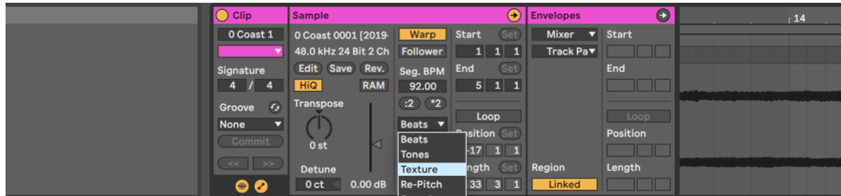
Figure 21.3. Ableton Live's Clip View illustrating a number of available Warp modes and the Transpose function, which are often combined and pushed to extreme settings live or via automation in pursuit of granular effects.

be argued then that pitch manipulation, even at its most discreet, results in textural artefacts of different shades on the scale of perceptibility. At this point we would suggest that it is necessary to further research the timbral (envelope, amplitude, spectral, etc.) ramifications of pitch processing more systematically.