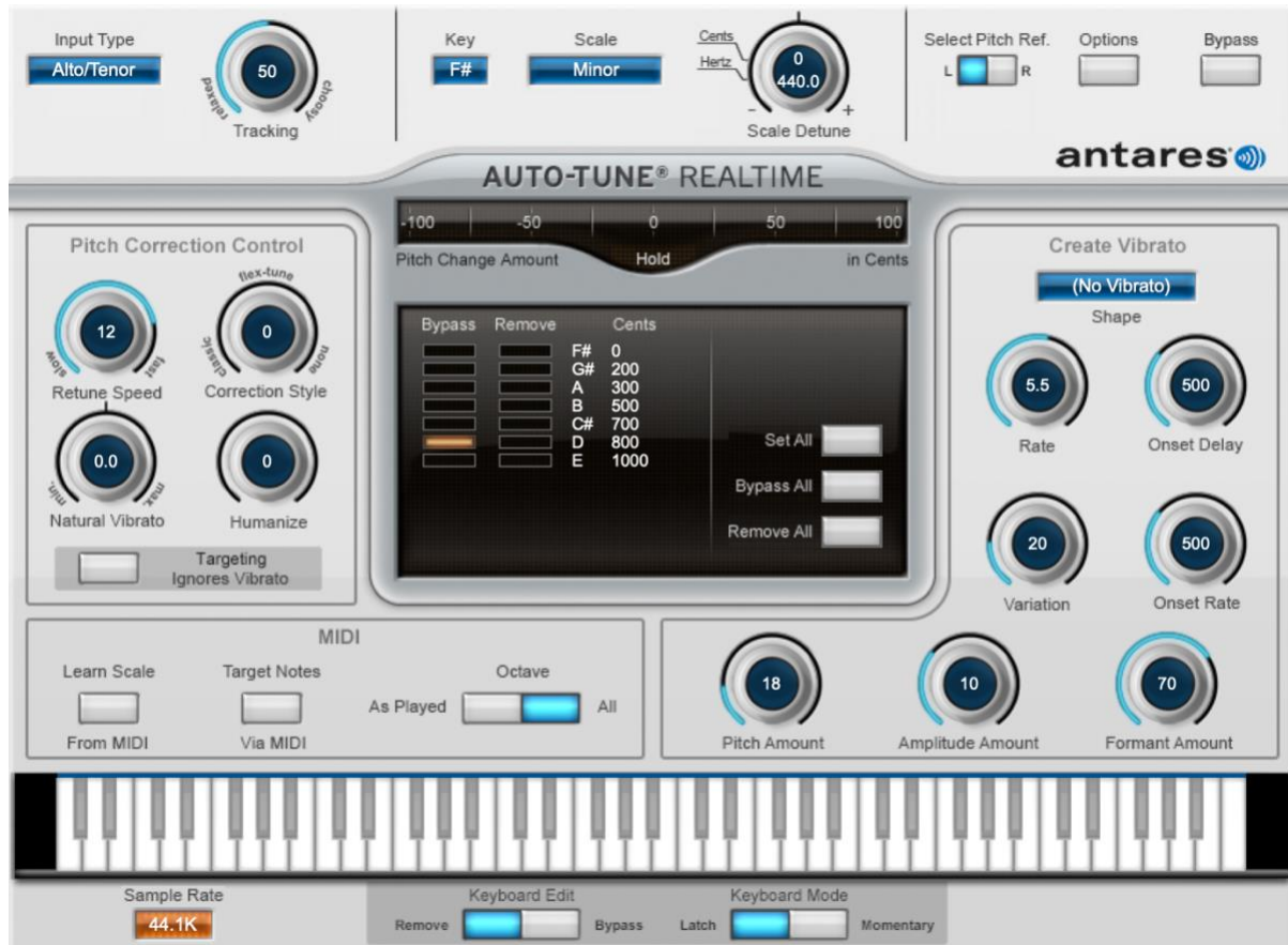
Figure 21.1. The Antares Auto-Tune Realtime UAD plugin window showing settings used by one of the authors on the lead rap voice for a recent Trap remix: a softer take on the hard “Auto-Tune Voice Effect” has been achieved (courtesy of the less than maximum Retune Speed setting), and one note of the F# minor scale selected has been bypassed to facilitate the “auto” mode without graphic intervention.

It is in comparison to Auto-Tune’s Graphic Mode that Celemony’s Melodyne (winner of the Technical Grammy in 2012) has brought creative advantages to the table since its first public viewing at the NAMM show in 2001. Melodyne takes the graphical interface possibilities further and expands the functionality – in later releases – to polyphonic pitch correction and manipulation. In a comparative review for Auto-Tune’s version 5 and Melodyne’s first plugin version, Walden (2007) points out that Melodyne’s ‘power takes it beyond the role of a purely corrective processor and into that of a powerful creative tool’. The “powerful” artefact-free algorithm has, as a result, enabled creative manipulation beyond simple pitch correction or hard pitch quantisation and many practitioners have been empowered by its intuitive interface, using it to create everything from Harmonizer-style pseudo-ADT (Anderton, 2018), through to artificial backing harmonies, and – notably also – Skrillex Bangarang -style (2011) “glitch” vocals (Computer Music Magazine, 2014).