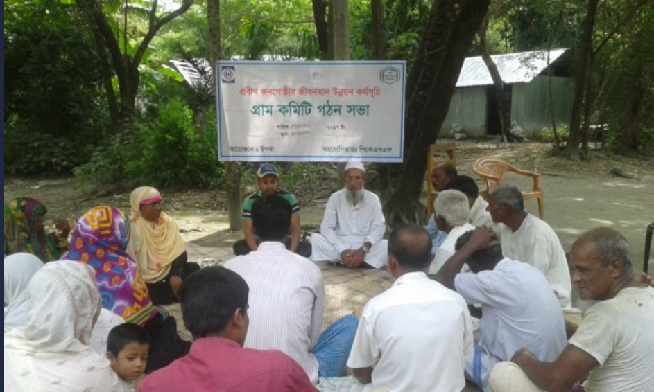
Monthly meeting of the old village committee