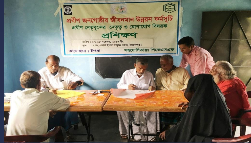
Leadership and communication training of senior leaders