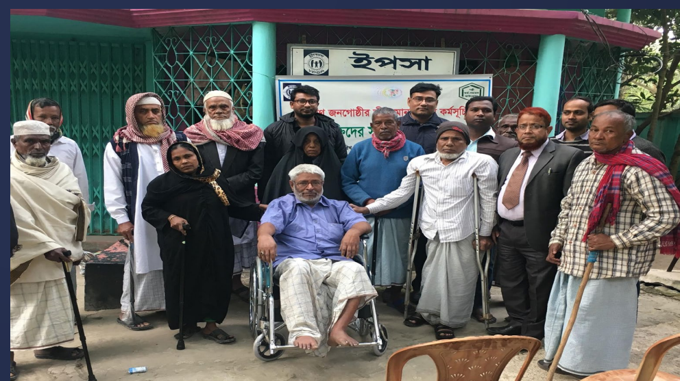
Deliverable aids to the elderly