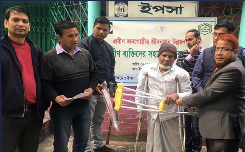
Disability friendly device distribution