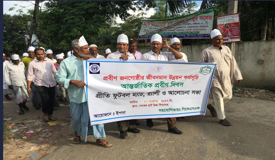
Rally of International Day of the Year 2012