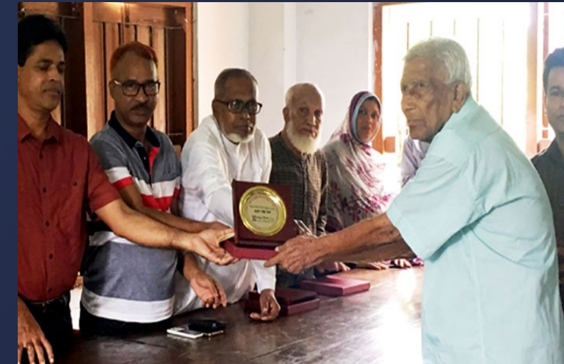
Recognition of Elderly people