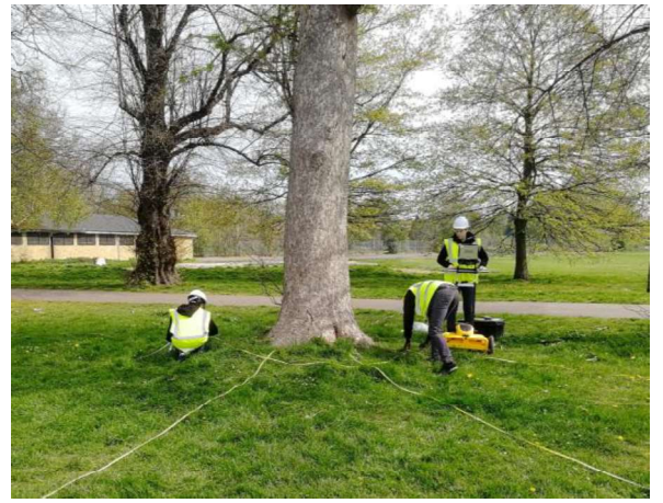
Fig. 1. The investigated area

This stage is aimed at reducing noise-related features in the GPR data, so as to produce measurable information and readily interpretable imagery for further results analysis. Data are