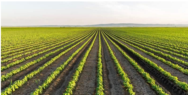
Photo 1 Example of monoculture farming field

Despite the heterogeneousness of European food supply chains and the abundance of sophisticated modern agricultural practices (monoculture farming), supply chains are constantly endangered. Agricultural risk management in the European Union or European Food Safety Authority (EFSA), with which the UK may still interact to some extent at member level, state that the weather including natural disasters and price volatility is considered by far to be the largest hazard along the supply chain. Other such threats of a slightly less significant level but still considered probable, include those of marketing difficulties, political measures, technological processes, input market and national debt. The ratio of distribution of risk factors associated with weather and natural disasters with compelling effects on farming, ranges between 86.4% in Poland and 52.3% in Germany. Where there is a significant disruption to the agricultural sector by any of the above risks, shortages of certain produce would be likely to occur, especially when considering the limitations of outbound producers.