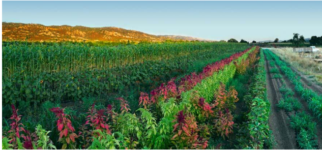
Photo 2. Example of diversified crop field

companies, however companies in some countries apply diversification at a much lower level. Most of the remaining risk management tools are derived from either private insurance policies or as financial support from governmental bodies. The aspects of actual crop losses due to the above risks seem to be forgotten despite being the most tangible.