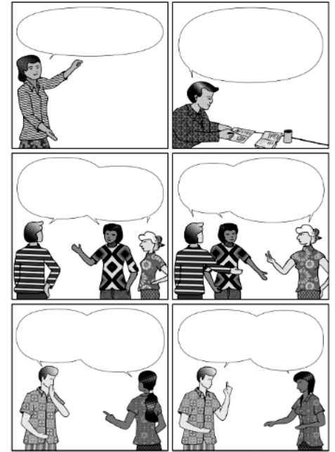
FIGURE 1 Concept- or summary-cartoon worksheet

Editorial or newspaper cartoons are another excellent source for a cartoon hook that brings the currency of many topics to the attention of students. Besides highlighting the latest political intrigues and drama, editorial cartoons depict and interpret the political thinking around many topics like global warming, air pollution, housing, transport, technology, infrastructure, social welfare and health. Taking a few minutes to analyse and discuss political cartoons, either collectively or as a think-pair-share activity, not only introduces the topic, but the creative illustration also helps to develop critical and analytical skills, deepen students' understanding of the public perception, and the civic impact of their discipline or profession (see Table 2). A variation to develop students' own positionality and reflection could include an individual or small group activity in which students complete a blank version of the newspaper cartoon and come up with their own satirical headline or comical dialogue. Facilitated with a short presentation and ranking of that which is the most humorous, satirical, entertaining, or relevant to the session topic will additionally stimulate engagement and contribute to students' sense of belonging.