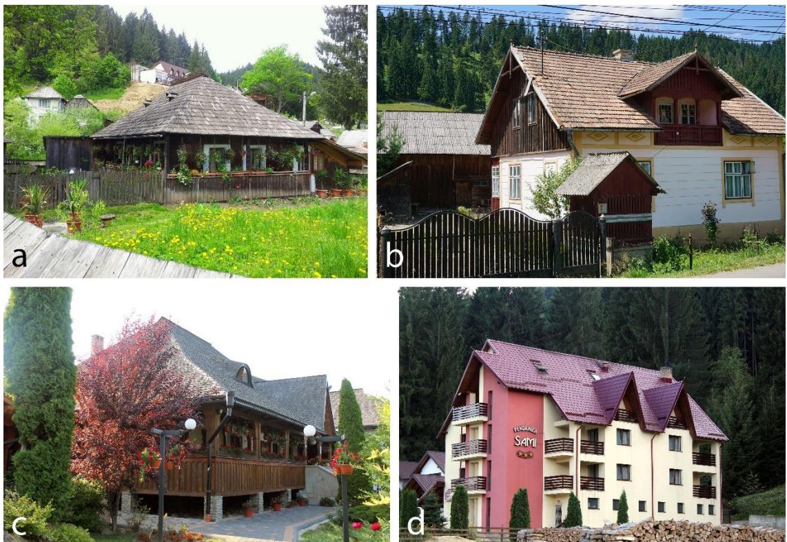
Fig. 3. Traditional vs Modern Buildings

of the respondents (53%) stayed in traditional houses, almost a quarter (23%) chose new buildings that followed the traditional style, nearly a fifth (19%) chose new buildings with a modern style, while the rest selected the not applicable (N/A) option. By traditional houses (see Fig. 3.a & b) we refer to old houses that were fully or partially adapted for receiving visitors; new buildings in traditional style are those new houses that follow the traditional elements of the area (see Fig. 3.c); while the new buildings with a modern style are those that do not follow the local architecture of traditional houses in the area (see Fig. 3.d). When asked to choose between traditional and modern style accommodation with the same utilities and level of comfort, the majority of respondents (79%) preferred accommodation units in traditional style.