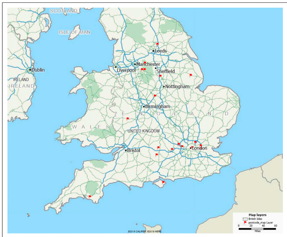
Figure 1. Geographical spread of participants who took part in the Delphi study. This image was produced by the research team using Maptitude 2019 (Calibre Corporation).

Statistical analyses. In addition to the rich qualitative data to support the formation of each statement, we wanted to explore whether there were any significant differences in the ratings given by those with YOD versus family supporters following Round 2. The distributions of the ratings for all 29