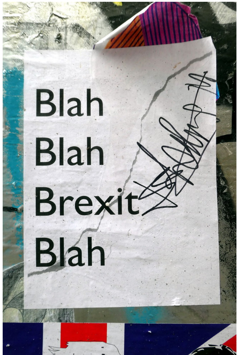
"street art, Shoreditch"

EU nationals are increasingly asked to prove their right to stay in Britain in the context of a continuous shifting of goal posts for lawful migration. What the hostile environment does is to make everyone feel precarious, including individuals and families who have resided in Britain for decades. It constructs all migrants, including EU citizens, as potentially 'illegal'. But this is not only about 'foreigners'. The Windrush scandal shows the contempt of the UK government for those who came from the former colonies as British subjects, a contempt no doubt deeply rooted in colonialism and racism. The ease with which the UK government has turned the EU citizens living in the UK into leverage in the Brexit negotiations with other European member states is also a testimony of the extent to which the hostile environment is pervasive and operates as a logic of governance. The Windrush scandal and its deep rooted links with British colonialism is another illustration of this racialised modus operandi that reshapes the rights of citizens and immigrant alike and the relationship between the state and its subjects, redefining the meaning of citizenship and belonging in the process.