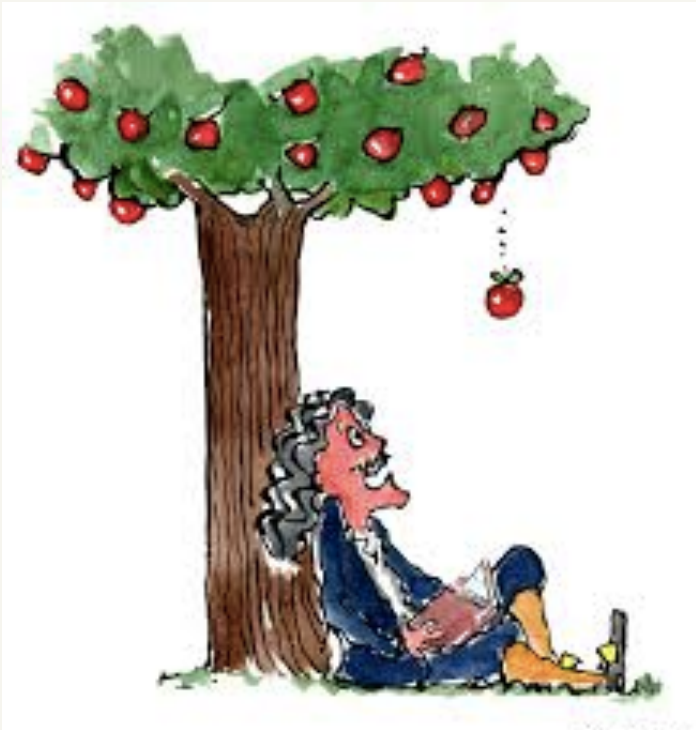
Sir Isac Newton

A study on corruption in Sweden by comparing it to Italy by some guys in the UK