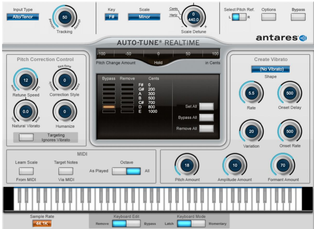
Figure 21.1. The Antares Auto-Tune Realtime UAD plugin window showing settings used by one of the authors on the lead rap voice for a recent Trap remix: a softer take on the hard “Auto-Tune Voice Effect” has been achieved (courtesy of the less than maximum Retune Speed setting), and one note of the F# minor scale selected has been bypassed to facilitate the “auto” mode without graphic intervention.

It is in comparison to Auto-Tune’s Graphic Mode that Celemony’s Melodyne (winner of the Technical Grammy in 2012) has brought creative advantages to the table since its first public viewing at the NAMM show in 2001. Melodyne takes the graphical interface possibilities further and expands the functionality – in later releases – to polyphonic pitch correction and manipulation. In a comparative review for Auto-Tune’s version 5 and Melodyne’s first plugin version, Walden (2007) points out that Melodyne’s ‘power takes it beyond the role of a purely corrective processor and into that of a powerful creative tool’. The “powerful” artefact-free algorithm has, as a result, enabled creative manipulation beyond simple pitch correction or hard pitch quantisation and many practitioners have been empowered by its intuitive interface, using it to create everything from Harmonizer-style pseudo-ADT (Anderton, 2018), through to artificial backing harmonies, and – notably also – Skrillex Bangarang -style (2011) “glitch” vocals (Computer Music Magazine, 2014).