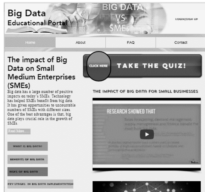
Figure 3. Prototype of the Big Data Educational Portal