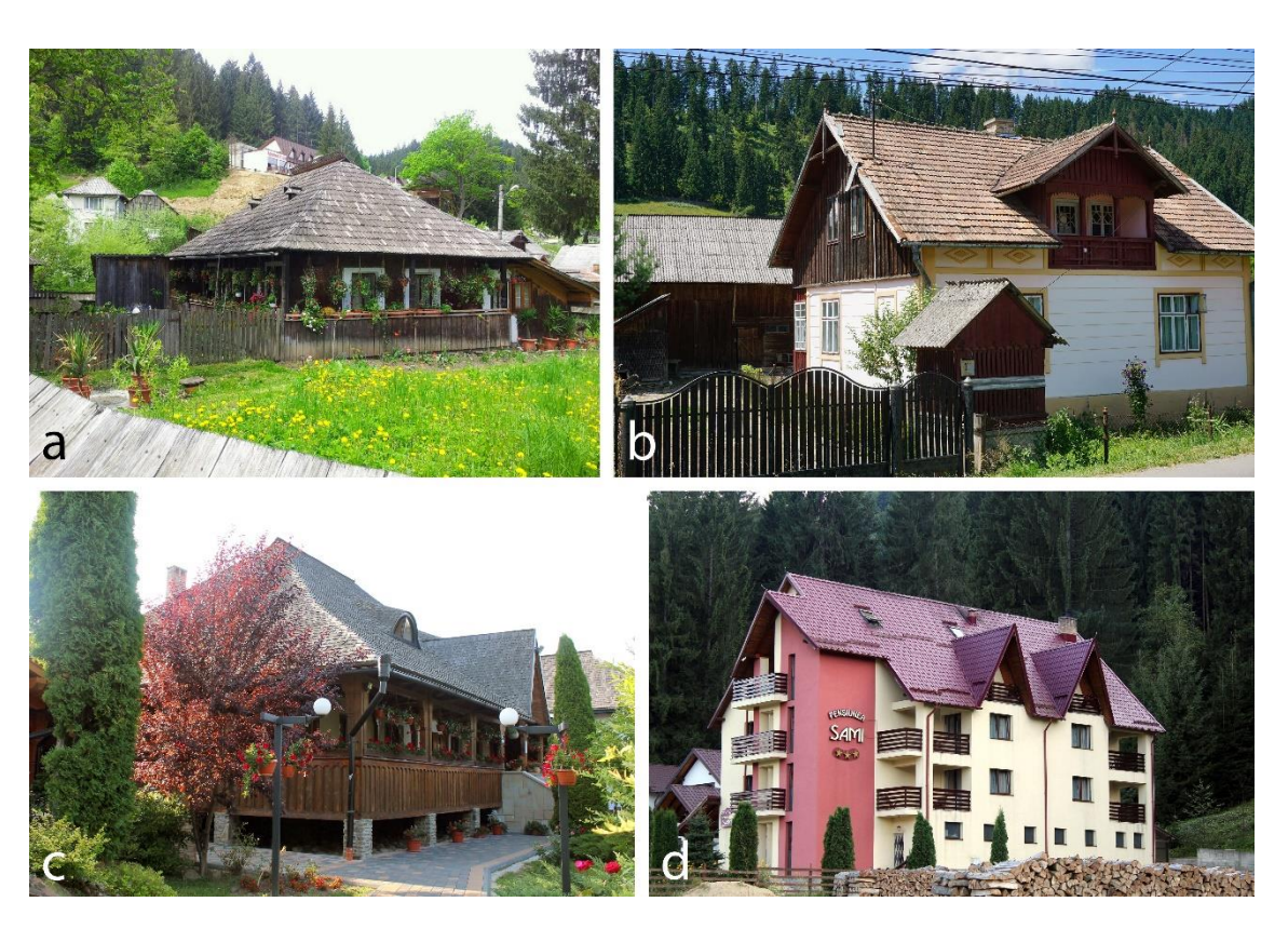
Fig. 3. Traditional vs Modern Buildings

of the respondents (53%) stayed in traditional houses, almost a quarter (23%) chose new buildings that followed the traditional style, nearly a fifth (19%) chose new buildings with a modern style, while the rest selected the not applicable (N/A) option. By traditional houses (see Fig. 3.a & b) we refer to old houses that were fully or partially adapted for receiving visitors; new buildings in traditional style are those new houses that follow the traditional elements of the area (see Fig. 3.c); while the new buildings with a modern style are those that do not follow the local architecture of traditional houses in the area (see Fig. 3.d). When asked to choose between traditional and modern style accommodation with the same utilities and level of comfort, the majority of respondents (79%) preferred accommodation units in traditional style.