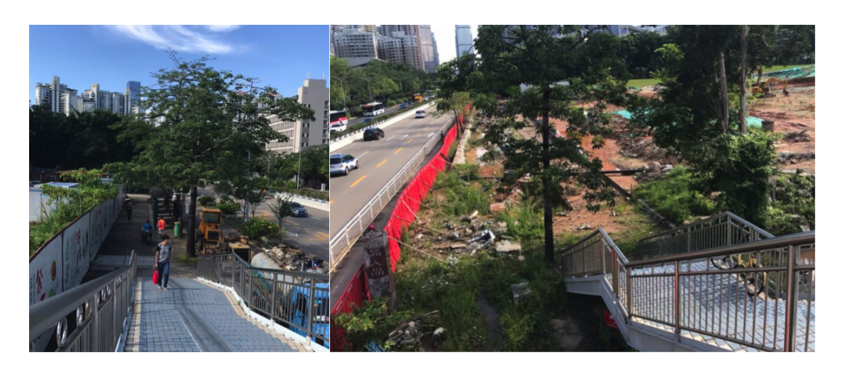
Figure 3 Construction sites narrowing pedestrian footpaths and creating walking obstacles

understand it is a necessary process when a city is developing. All these negative impacts are unavoidable... But I am sure the situation will be changed once all the work is done...so I feel ok walking along this route...I am always thinking It will be more convenient to travel in the future because we will have a metro station here!" [female, 28, Xinzhou, innerhigh]