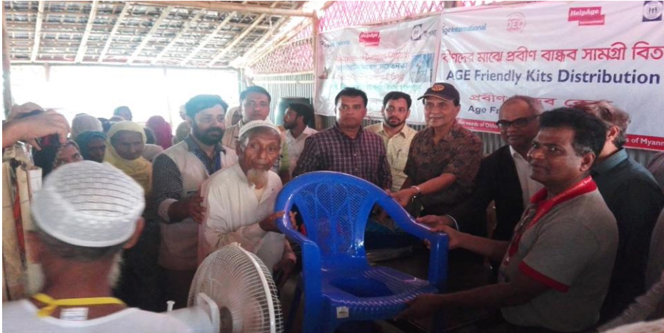
Ex. Cabinet Secretary Distribute Age Friendly Kits to Disable OP