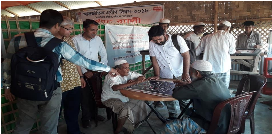
Recreation facility for Elderly People